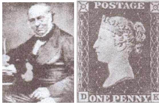
Sir Rowland Hill and the first stamp

For centuries, their parcels, passports, announcements travelled in the bags of animals, in the chests of ships, in the trunks of coaches.