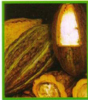
fruit of the cocoa tree